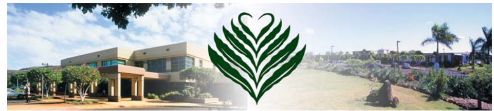
West Kauai Medical Center • Mahelona Medical Center • West Kauai Clinics

We welcome and value your input! Email KauaiStrategyInput@hsc.org